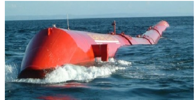
Figure 1. A Pelamis wave energy converter is a 'sea snake' made of four sections, each the size of a railway locomotive. It faces nose-on towards the incoming waves.

Level 4 assumes that the UK deploys the equivalent of around 27 000 Pelamis machines over a 900 km stretch, involving installing the full capacity north of Ireland as well as some off the south-west tip of Cornwall (see Figure 2). These machines are also assumed to be more efficient, delivering 10 kW per metre (25% of the waves' raw power). With a 90% availability, the total output of such wave farms is 71 TWh/y.